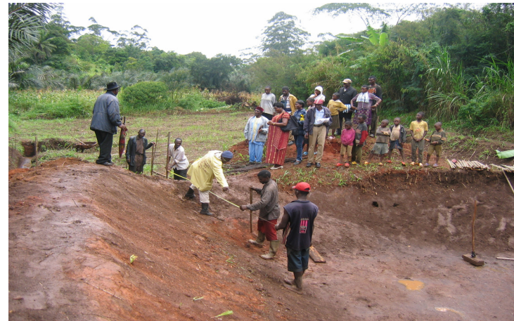
Farmer's Training in air layering and fishpond in Belo and Bawouwoua

3. Bawouwoua learning resource centre for integrated agroforestry and fisheries management