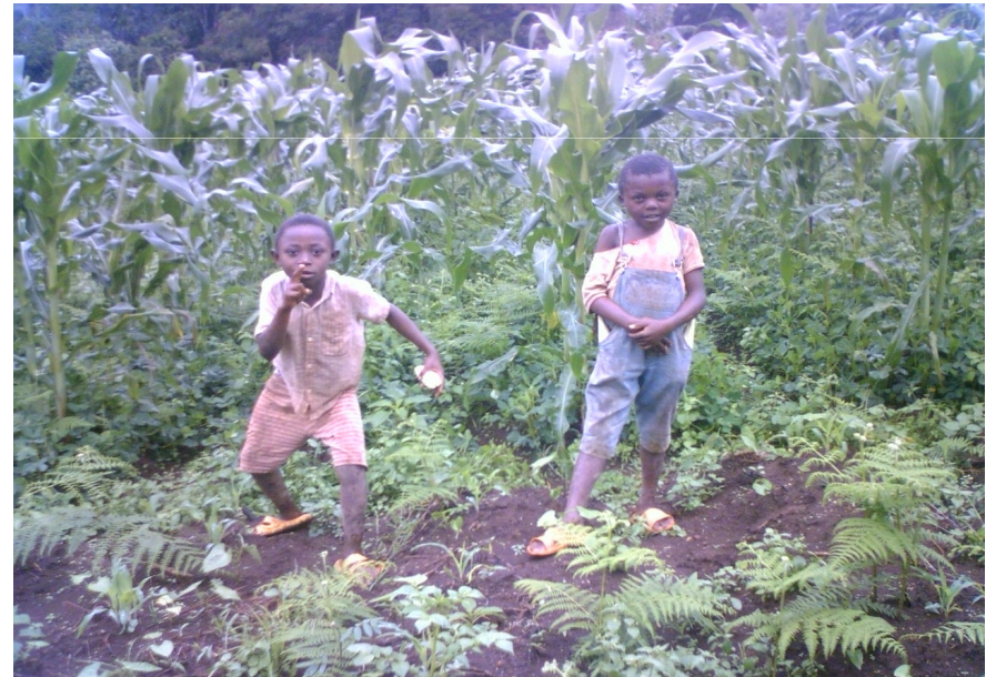
Experimental plot in Domni resource centre, Bandrefam