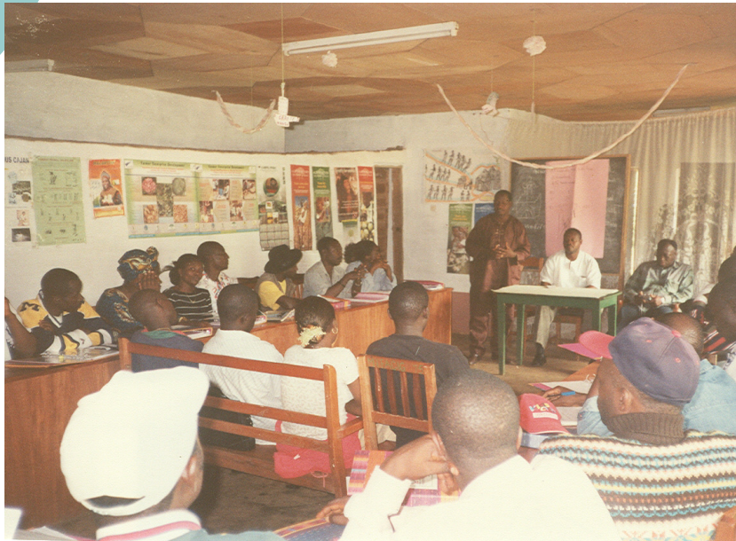
A training session in MIFACIG resource centre, Belo