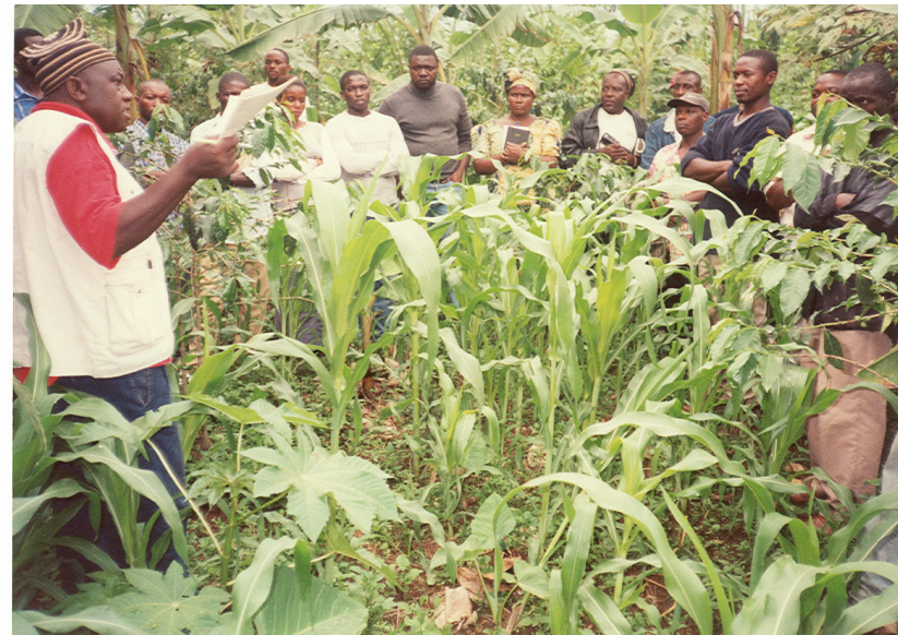
Group discussion in farmer's field